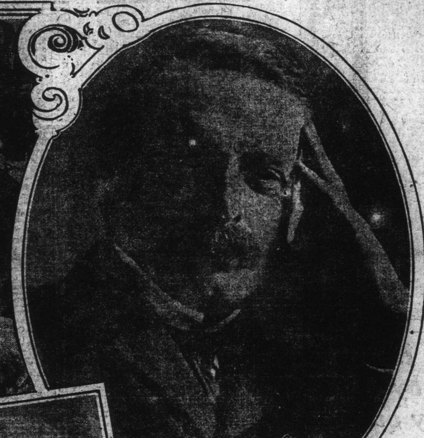
MR. LLOYD GEORGE FROM CALGARY

The Alberta is very grateful to its friends for their kindness at this time of trouble. To our contemporaries, the Herald and News-Telegram, we are most deeply indebted.