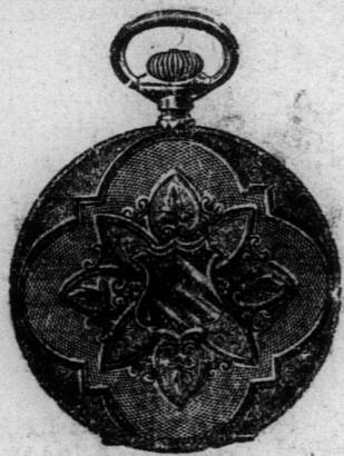
On Exhibition at BULLER BROS. and NEW- MAN AND SONS' Jewelry Stores.