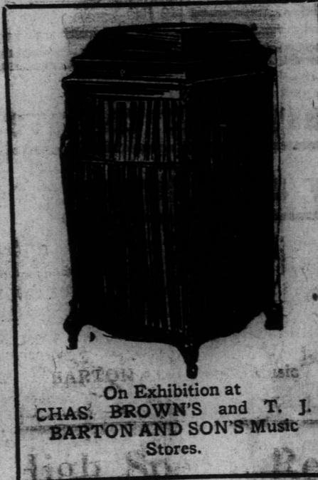
On Exhibition at CHAS. BROWN'S and T. J. BARTON AND SON'S Music Stores.