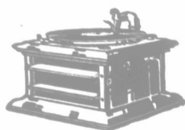
Columbia Grafonola $38

as the great church organ's music is checked or swelled by the player and his stops. And, of course, there's the magnificent Columbia Record repertoire—great bands—great singers—great violinists—great comedians. If it is