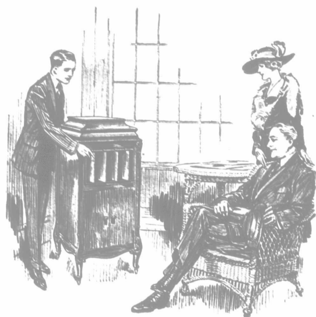
They make you feel at home in the Grafonola Store.

The Grafonola is the instrument that makes "Tone", which is music's soul, its watchword—the instrument with the high-grade motor and the exclusive Columbia "tone leaves" by which the volume can be controlled on the same principle