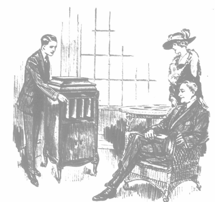
They make you feel at home in the Grafonola Store.

The Grafonola is the instrument that makes "Tone", which is music's soul, its watchword—the instrument with the high-grade motor and the exclusive Columbia "tone leaves" by which the volume can be controlled on the same principle