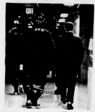
'All's well that ends well.