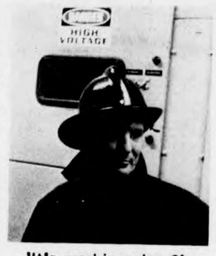
'It's working okay?'