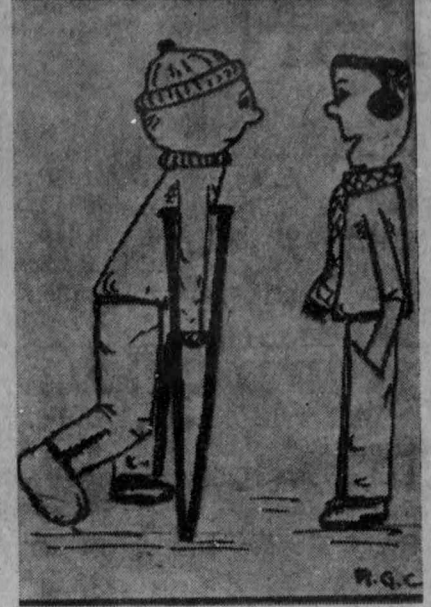
see you did a bit of skiing during the Christmas holidays!