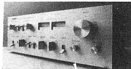
CA610 AMPLIFIER 2 x 40 RMS 0.05 THD