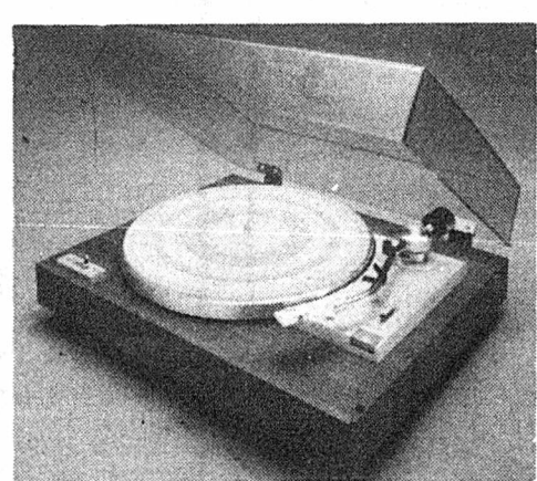
TY 211 SEMI-AUTO Turntable Belt Drive