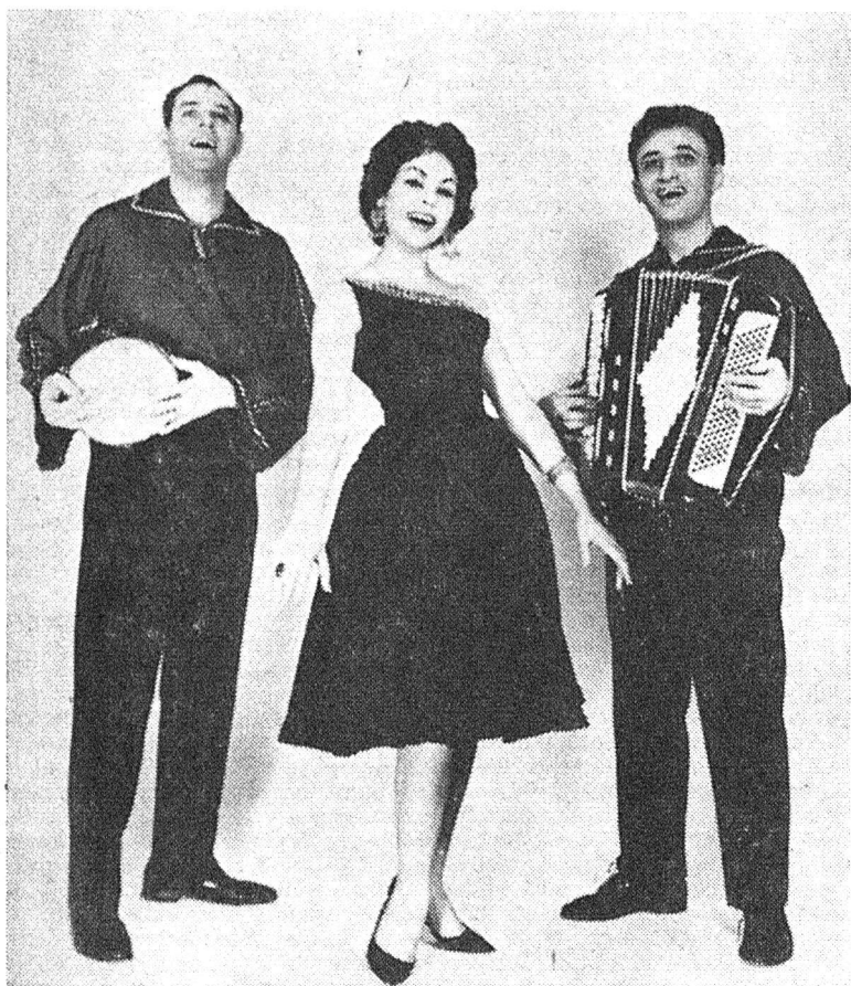
ORANIM ZABAR SINGERS

A trio of young folk singers from Israel who call themselves Oranim Zabar will present songs from Israel and around the world in Convocation Hall, at 8:30 p.m., Monday, March 6. The singers are being brought to Edmonton by the Folk Music Society and the campus concert has been arranged with the co-