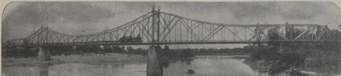
Bridge over the River Menam designed and constructed for the Royal Siamese State Railways.

Specialists in the Design, Manufacture and Erection of Bridges and all classes of Iron and Steel Structural Work.