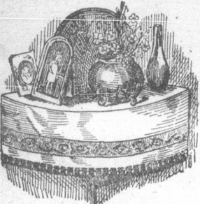
A CORNER BRACKET.

A large bracket, fastened to the wall in a corner in such a manner that it is capable of supporting considerable weight, is very useful and answers many purposes of a small stand.