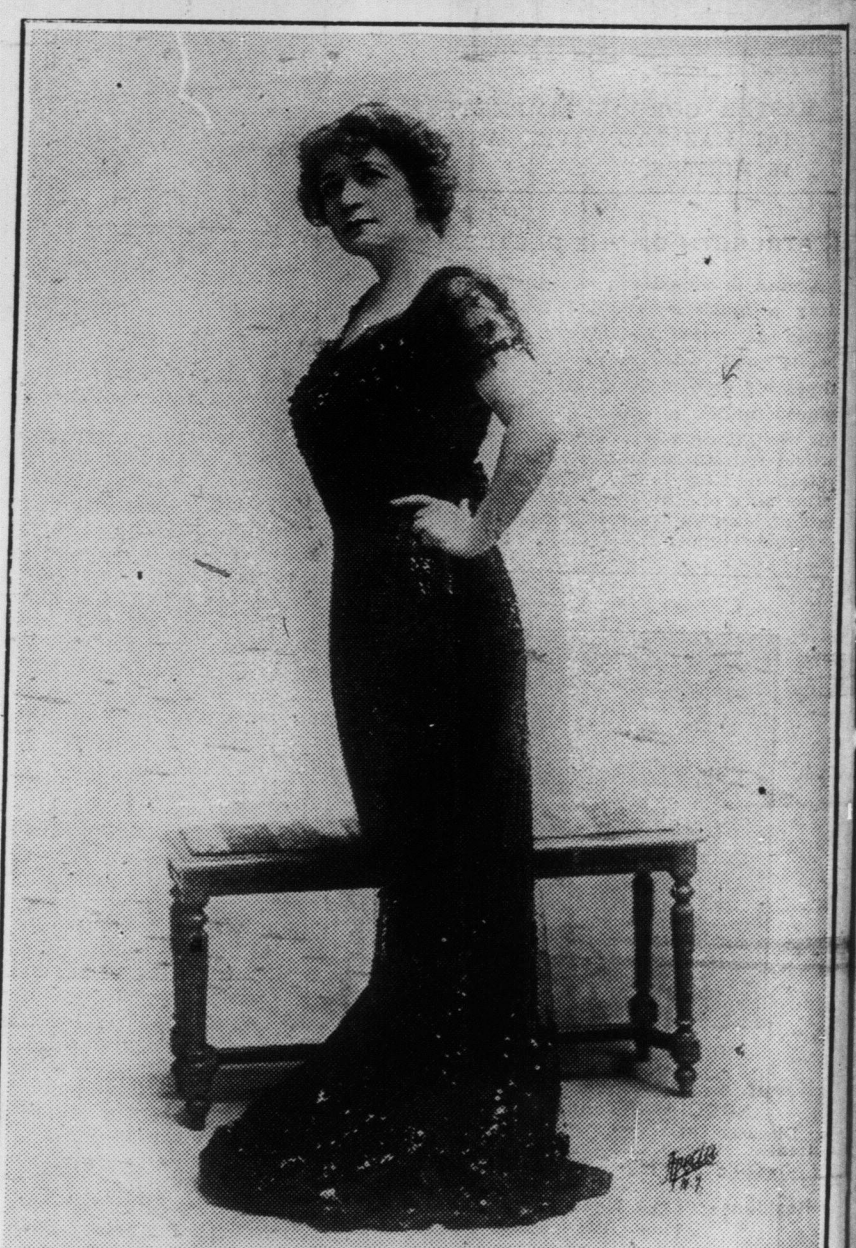
EUGENIE BLAIR, TALENTED EMOTIONAL ACTRESS, WHO WILL BE SEEN IN HER LATEST SUCCESS, "THE TEST," AT THE GRAND ALL THIS WEEK.

Japanese dentists have introduced wood as a substitute for porcelain and rhinoceros ivory in the making of false teeth. The wooden teeth used by the Japanese dentist are remarkably natural in appearance and in the fine blujsh color peculiar to the teeth of the Malay race. The teeth are fastened in place by a secret process jealously guarded by its inventor.