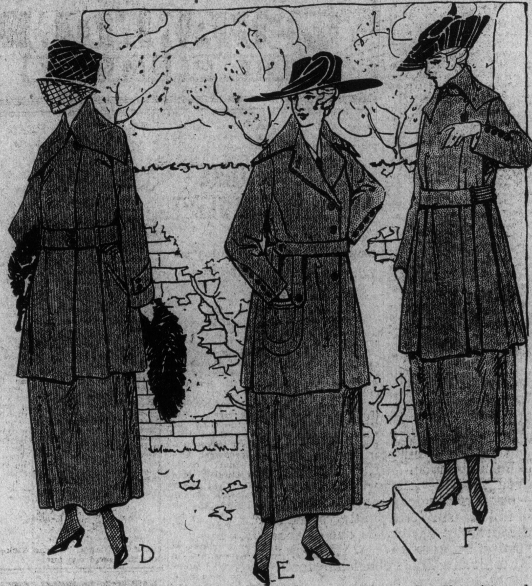
D. Is it not smart? And at the same time does not the dignity of its design appeal to you? Fashioned of fine gabardine, it hies from a house which specializes on the making of mourning suits, and is, therefore, correct in every detail. Its buttons are of dull black, as is the silk of which the coat is lined. The straight lines of the silhouette, so modish for Autumn, distinguish it. Price, $45.00.

I N OUR FRENCH ROOMS women will find much that is charming in the suit of black; further, they may make their selections with a degree of privacy. Throughout the department also are many new and smart suits of Autumn's newest modes. It has been possible to illustrate but a few garments.