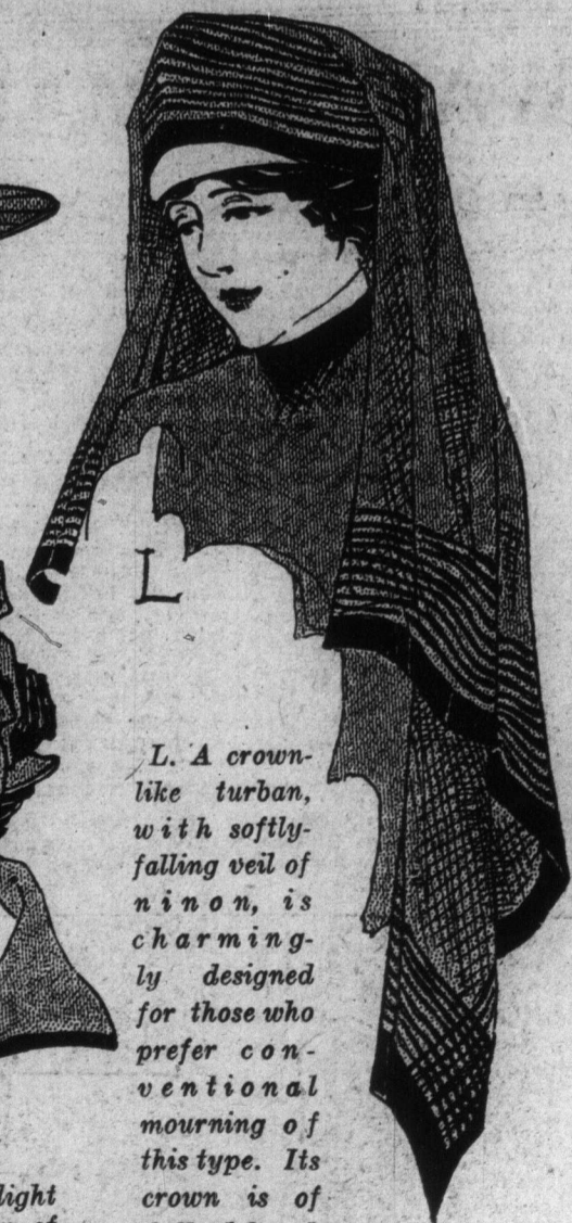
L. A crown-like turban, with softly-falling veil of ninon, is charmingly designed for those who prefer conventional mourning of this type. Its crown is of dull black silk, its brim of white crepe, draped with the prettily bordered veil. Price, $8.50.

Black Coats, Specially Priced for Clearance at $10.00