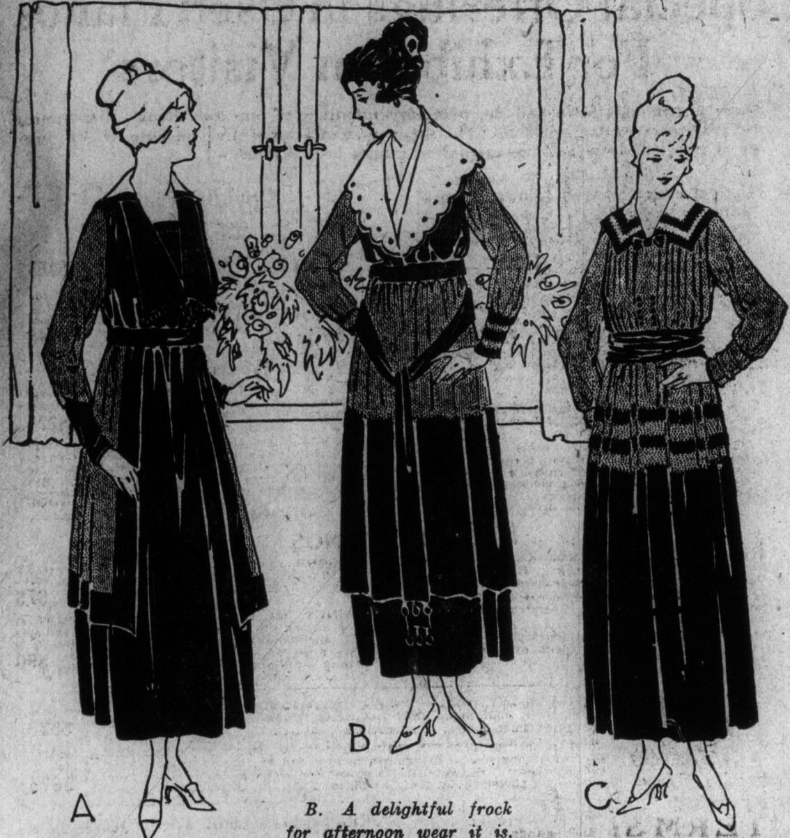
A. Of charming design is this frock, fashioned of crepe de Chine and Georgette crepe. Over the softly-draped skirt falls a graceful pannier of Georgette crepe, bound in crepe de Chine. The bodice, which has pointed lapels, is made of Georgette over silk, sleeves are of filmy Georgette, and a small collar of white crepe lends a light touch. In sizes 34 to 44. Price, $25.00.

S OFT CREPE DE CHINES prettily combined with Georgette crepes, subtle satins, taffetas and serges—of any of these materials may be had attractive frocks for women who are wearing black. Characteristic of the array are the modish designs here depicted.