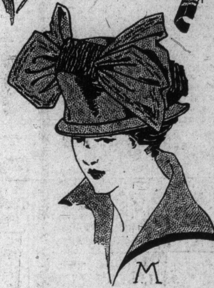
M. Gaining a light touch in its underbrim of white pleated silk is a smart turban with high crown and broad bows. A band of black crepe distinguishes it as a mourning hat. Price, $7.50.