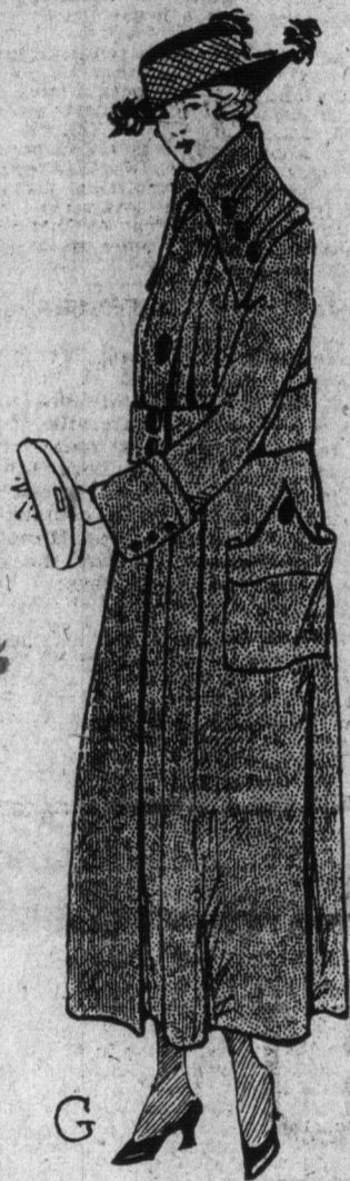
G. Evolved from a fine black velours is this smart coat, which would delight women because of its smart and practical lines. Silk stitching and buttons adorn it, and it bids well to brave the battles of daily use. Sizes 34 to 44. Price, $27.50.

A ND THE SIMPLICITY OF THE SEASON'S DESIGNS well becomes the coat of black. Designers have expended time and attention upon coats for mourning wear, and their pride in the result is justifiable, and divers weaves, including velours, broadcloths and the new pom-pom are most in favor, and are fashioned in a number of charming styles, without trimmings, or with touches of dull black. All are beautifully and appropriately lined. Prices, $27.50 to $75.00.