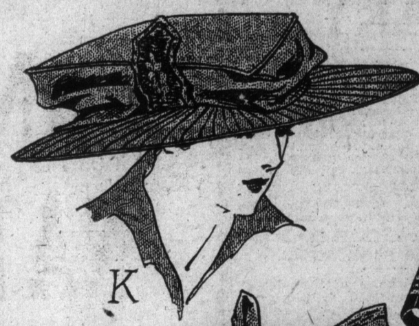
K. The broad sweep of its brim, and the soft, draped crown, combine in giving attractive lines for the crowning of young heads. This particular model is of peau de soie, the pleated brim having insets of ninon, and the three-sided crush crown being adorned with a silk-embroidered ornament. Price, $8.50.

D EVOTED to the display of millinery which is correct, yet pretty, for women who are wearing black is a section of our Millinery Department. All that is attractive for women of all ages is shown there in pleasing diversity. The few illustrations here-with are representative.