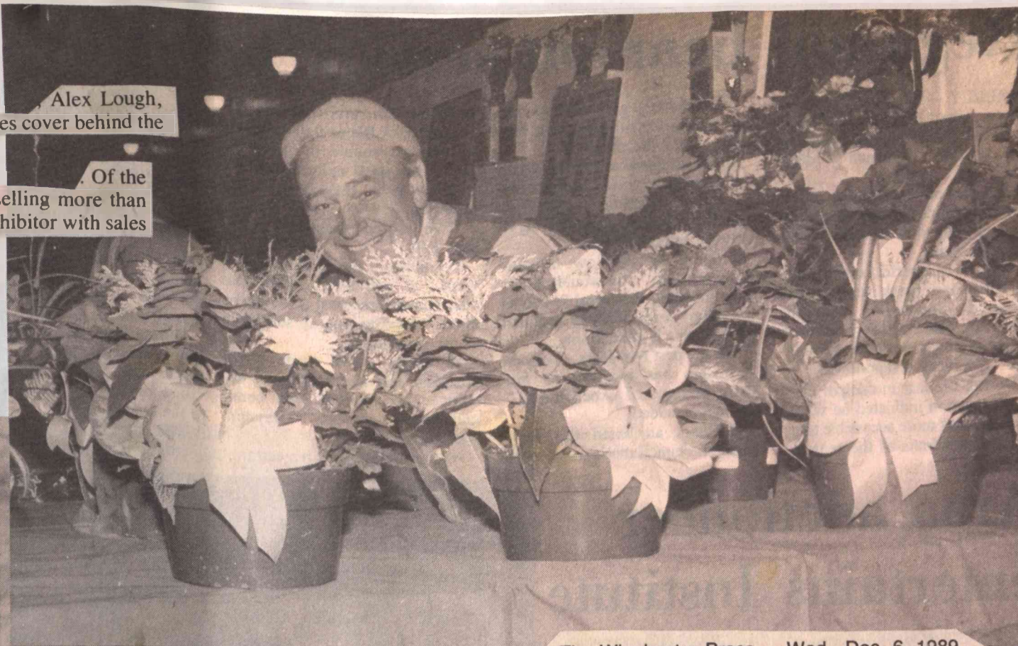
The Winchester Press Wed., Dec. 6, 1989