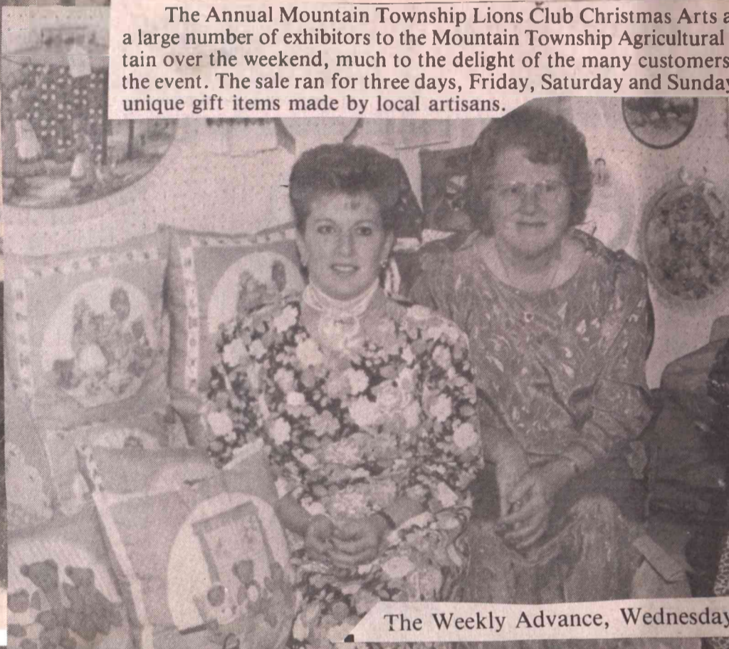
The Weekly Advance, Wednesday, December 5 1990