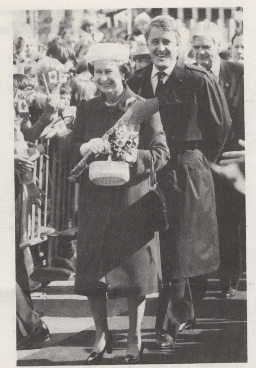
Queen Elizabeth II and Prime Minister Brian Mulroney arrive on Parliament Hill in Ottawa.

The Royal couple also visited Fort Wellington which was built by the British in the War of 1812 to protect the St. Lawrence