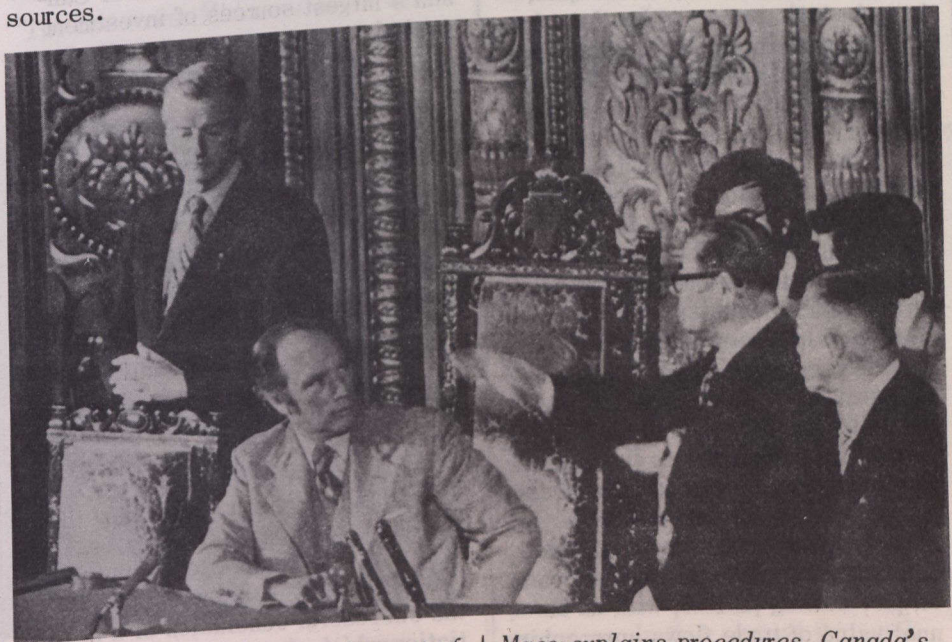
Prime Minister Trudeau, in the seat of the Speaker of the Japanese House of Representatives, listens as Speaker