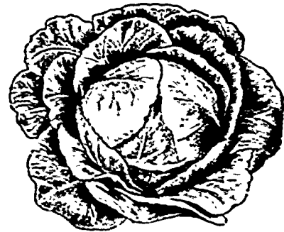
HENDERSON'S EARLY SUMMER CABBAGE.