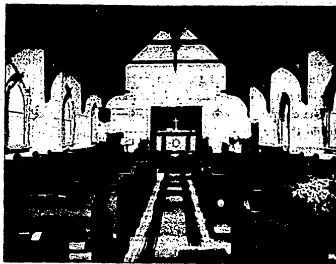
ST. JOHN'S, MOOSE JAW (INTERIOR.)