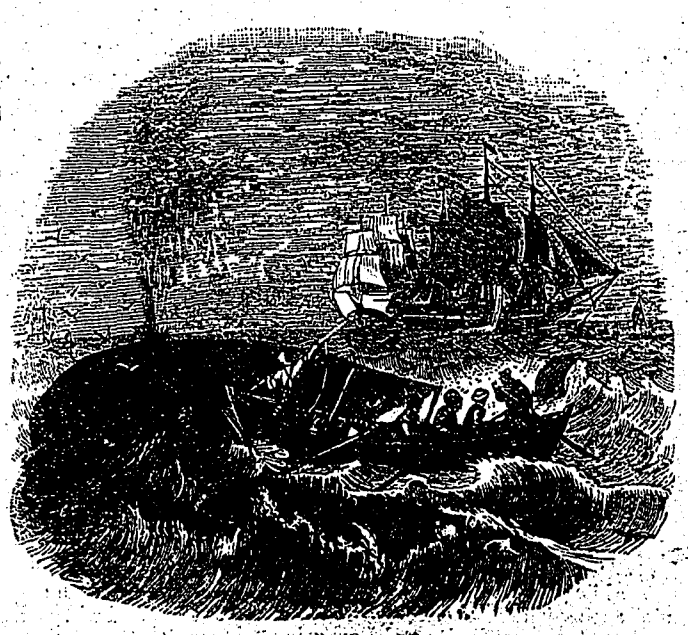
HARPOONING A WHALE,