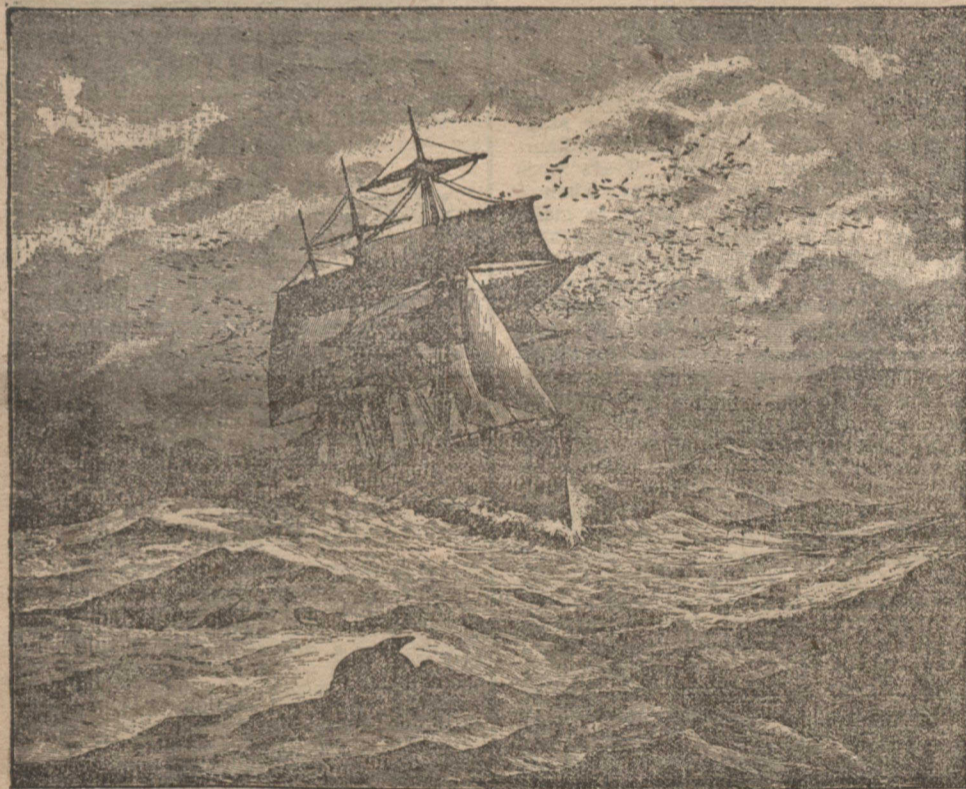
BIRDS RESTING ON THE RIGGING OF A SHIP.

In the next world, how sweet the reflection will be that we devoted all our time and