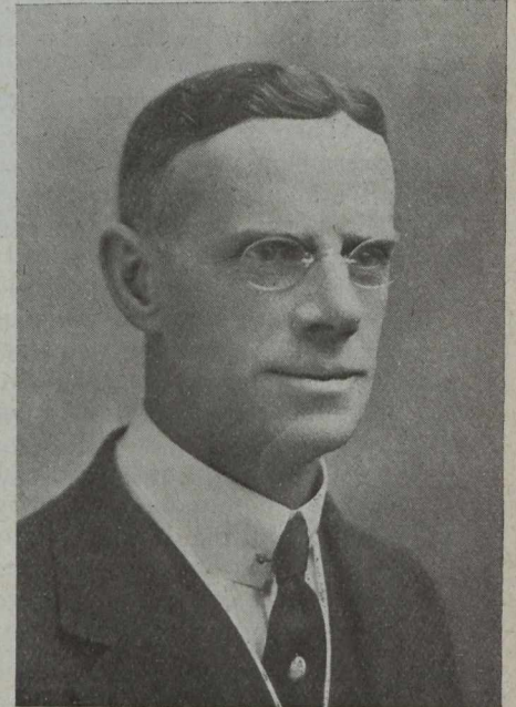
First Officers of the Association of Canadian Building and Construction Industries