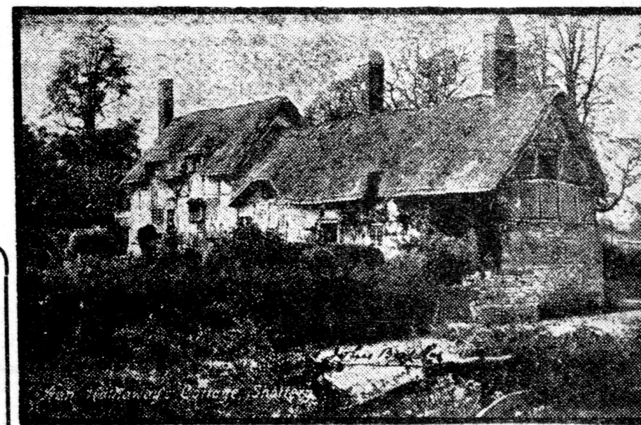
ANN HATHAWAY'S COTTAGE, Stratford-on-Avon.