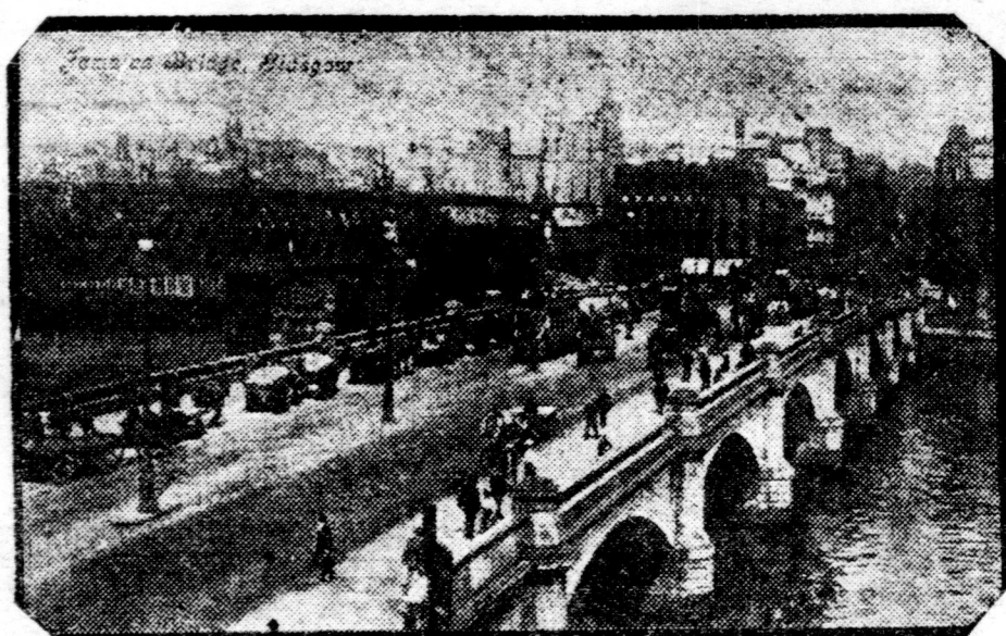
JAMAICA BRIDGE, GLASGOW.