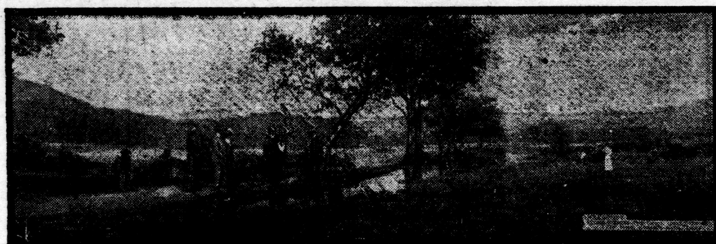
LOCH KATRINE, A BEAUTY SPOT IN THE TROSSACHS.