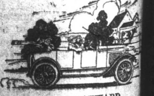
BERT HAYWARD, Water Street.