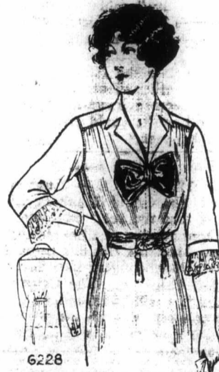
Novel Yoke Waist.

This stylish design has a short yoke at the shoulders in both front and back. It opens quite low in front and the edges of the opening are trimmed with a handsome notched collar. The sleeves have no buttons at the shoulder and may be elbow length, or finished, shirt fashion, at the wrist.