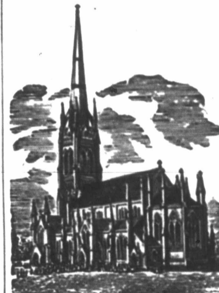
St. James' Cathedral, King St., Toronto, contains 500,000 cubic feet of space and is successfully eated with four of our Economy Heaters.