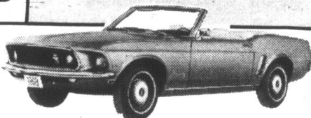
1969 MUSTANG CONVERTIBLE

Automatic, power steering and brakes, power top, whitewalls, console radio, wheel covers. List $4,558.00. Sale Price