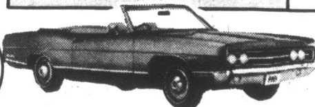
1969 GALAXIE CONVERTIBLE

Woodland Motors puts the TOPS & PRICES DOWN!!