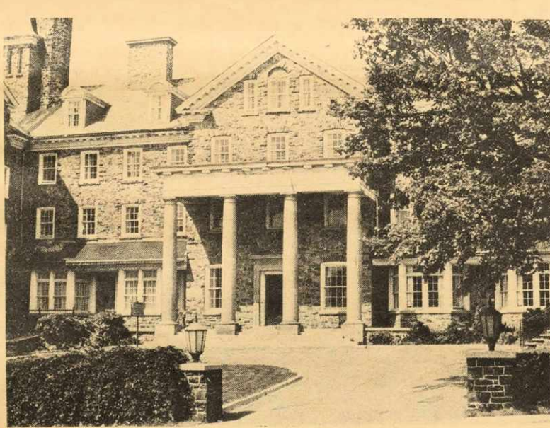
Shirreff Hall: Women's residence, dining hall, (food services), Dean's office and apartment