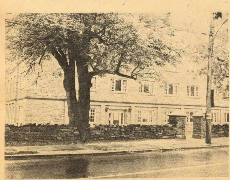
Howe Hall Student Health Services, Men's Residence, Dean of Men's office, Dean's apartment, Visitor's apartment, dining halls