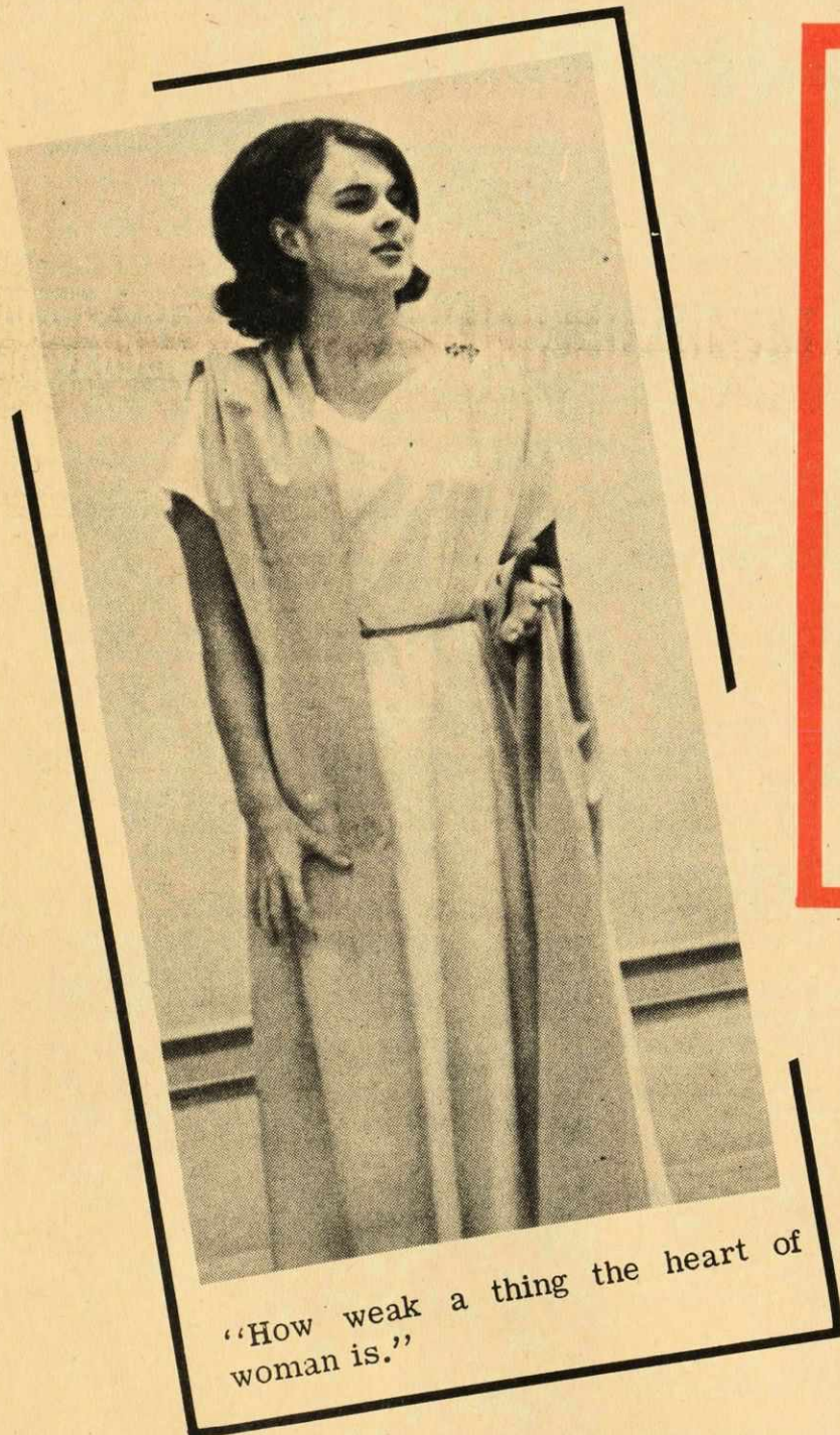
"How weak a thing the heart of woman is."