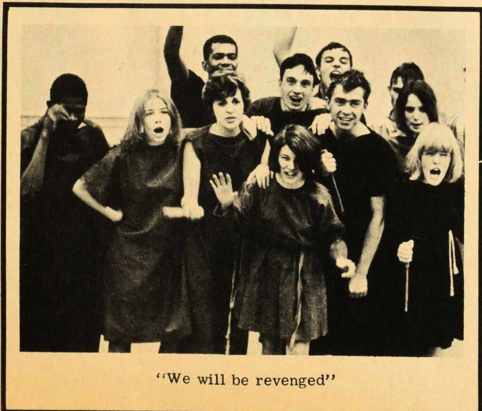
"We will be revenged"

The Drama Workshop, a branch of Dalhousie's English Department, is happy to present in Canada's election year one of the most thoughtful political studies ever written. Julius Caesar is directed, acted and managed by Workshop staff and students who are participating in the Drama programme.