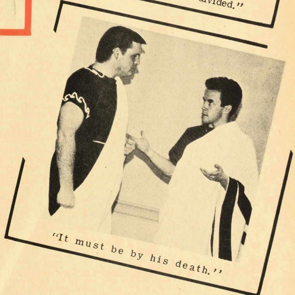
"It must be by his death."