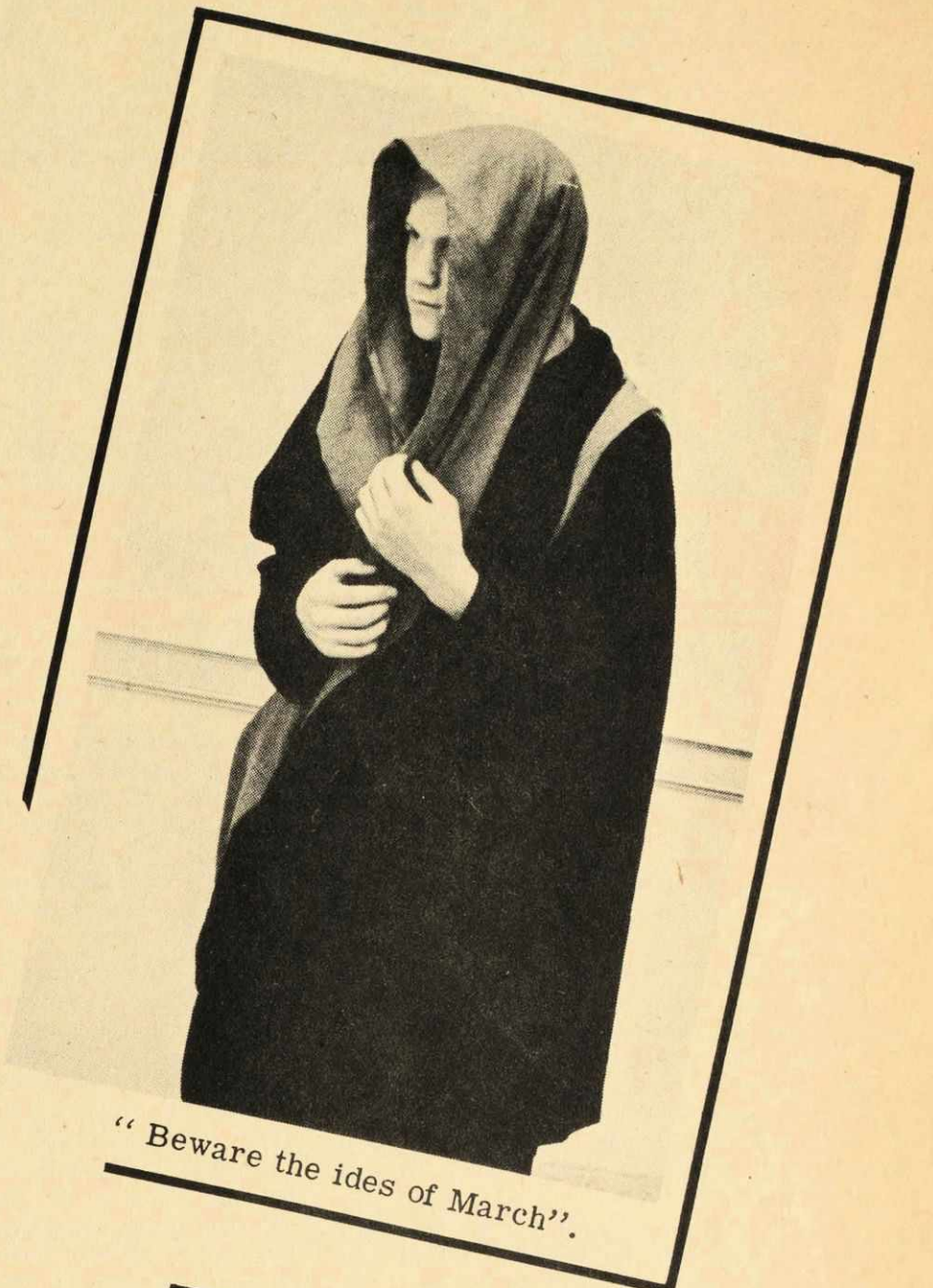
"Beware the ides of March".