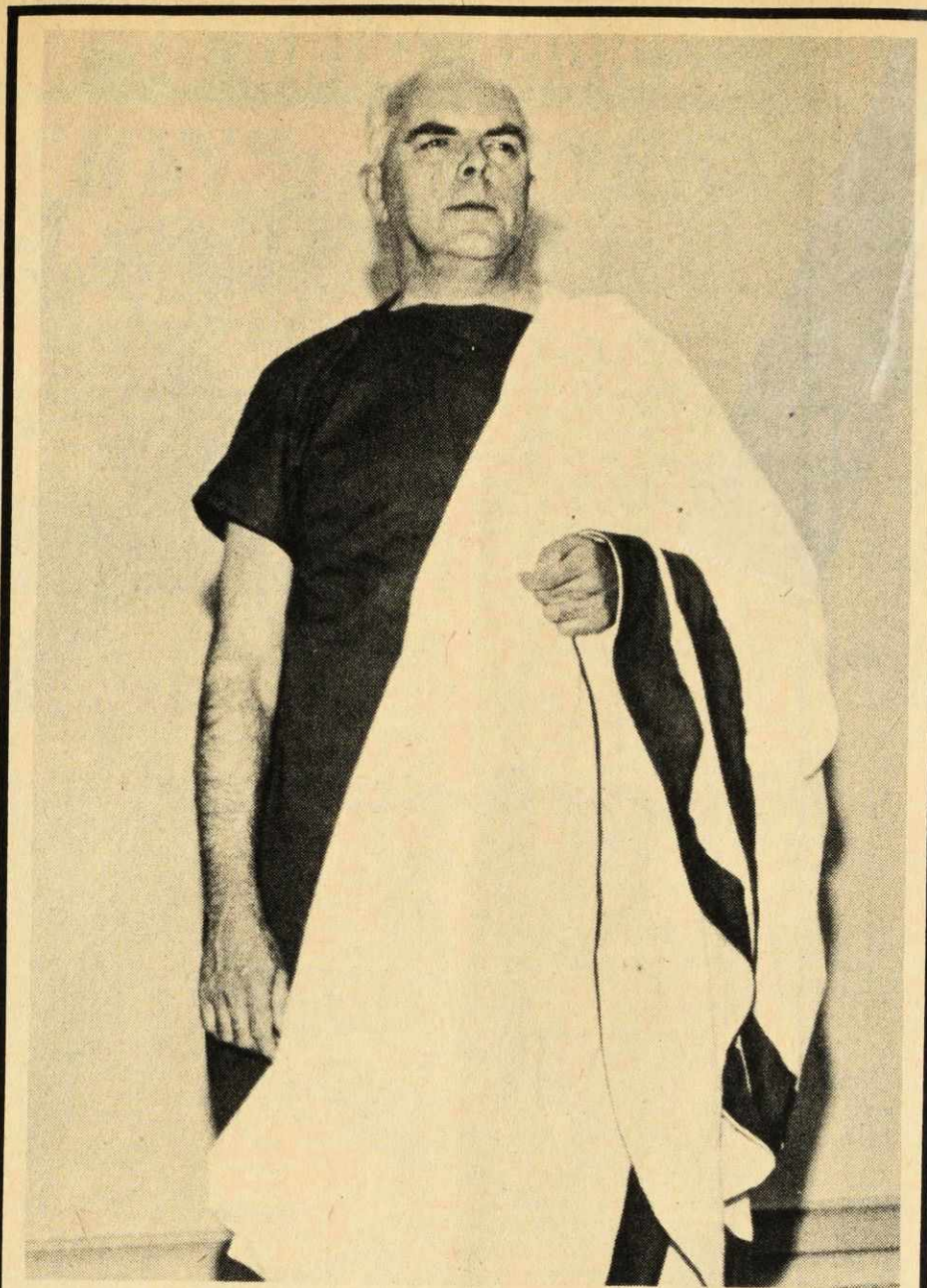
"What can be avoided whose end is purpos'd by the mighty gods."