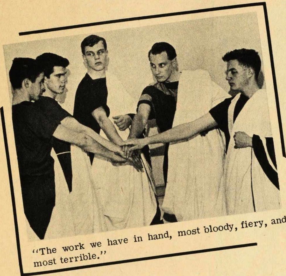
"The work we have in hand, most bloody, fiery, and most terrible."