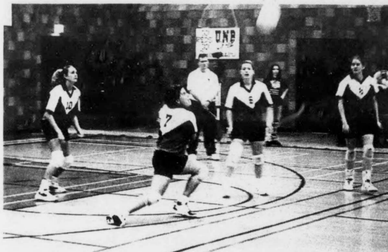
The V-Reds in action against Acadia.