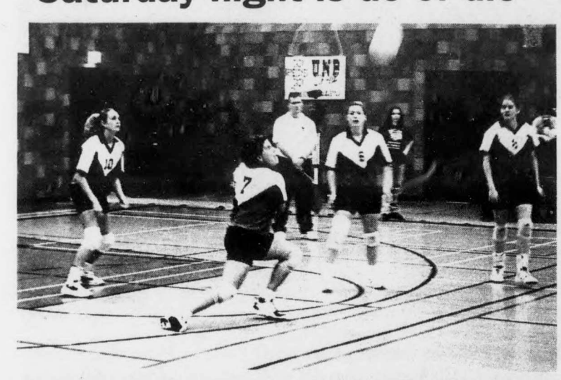
The V-Reds in action against Acadia.