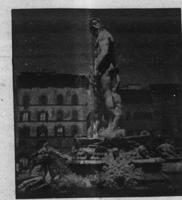
▲ Piazza della Signoria, Florence