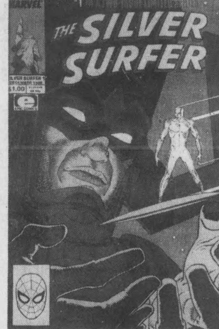
SILVER SURFER: PARABLE ($1.25 - Epic Comics)