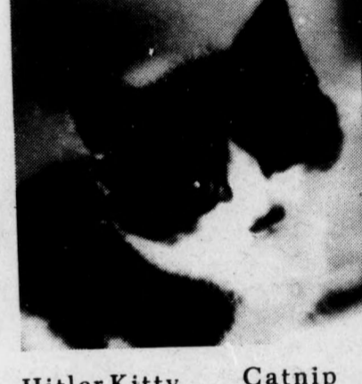
Hitler Kitty Catnip