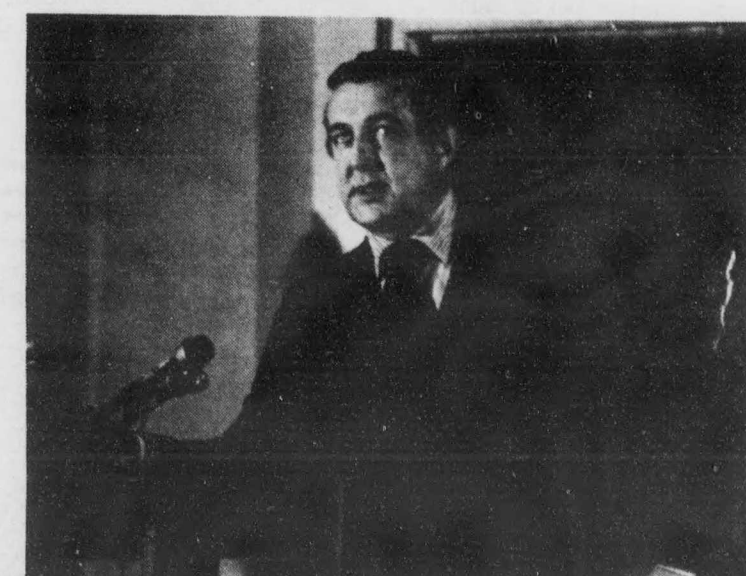
"What are you looking at me for? Do I have a guilty look?"