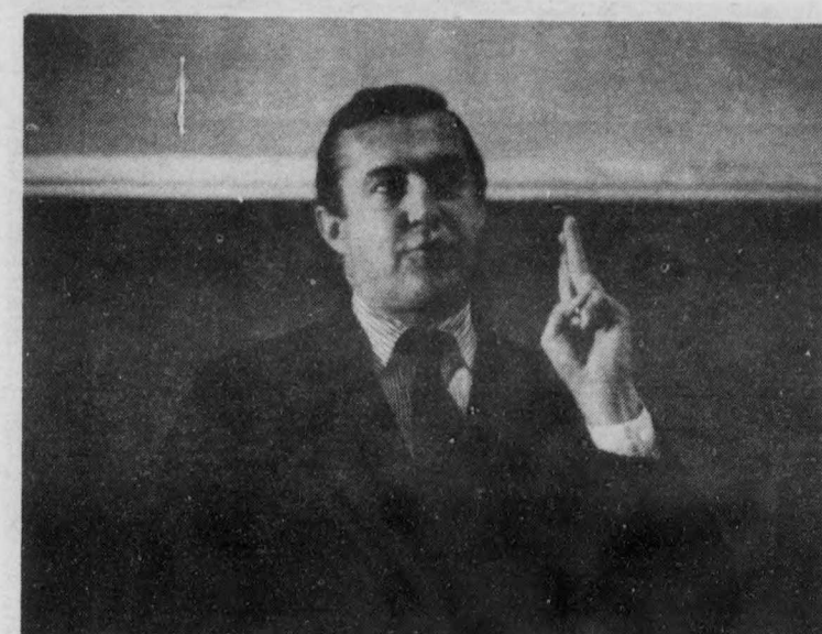
"Now, up there, class, is the ceiling."