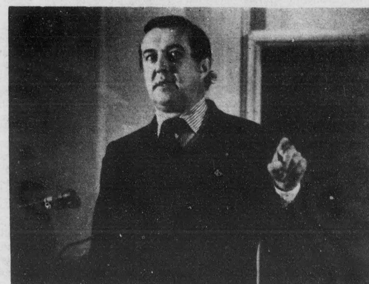
"Uh, waiter, please, waiter . . ."