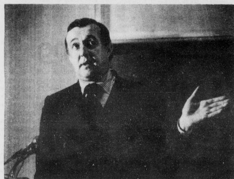
"If you misbehave once more you're going to bed without your supper!"