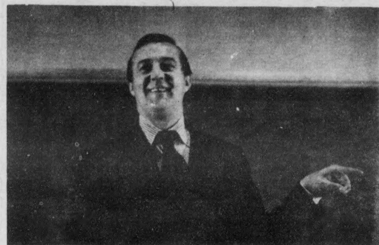
"Why did you give away my punchline?"