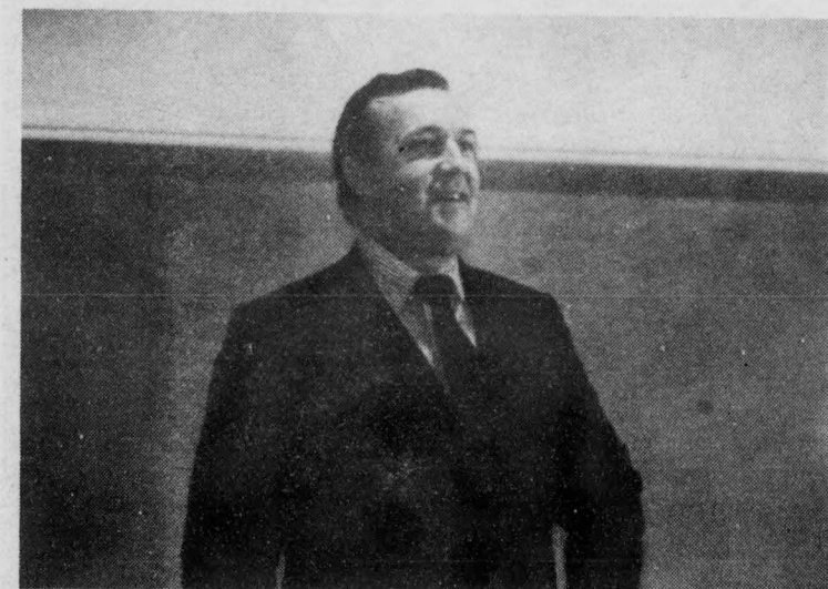
"I can't tell I'm wearing a girdle . . . 18 hour . . ."