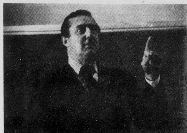
"NEVER put your hand on a hot stove!"