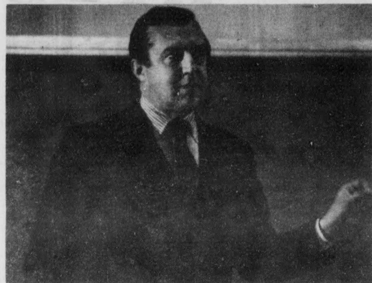
"I'm overlooking a four leaf clover . . ."

By Derwin Cowan