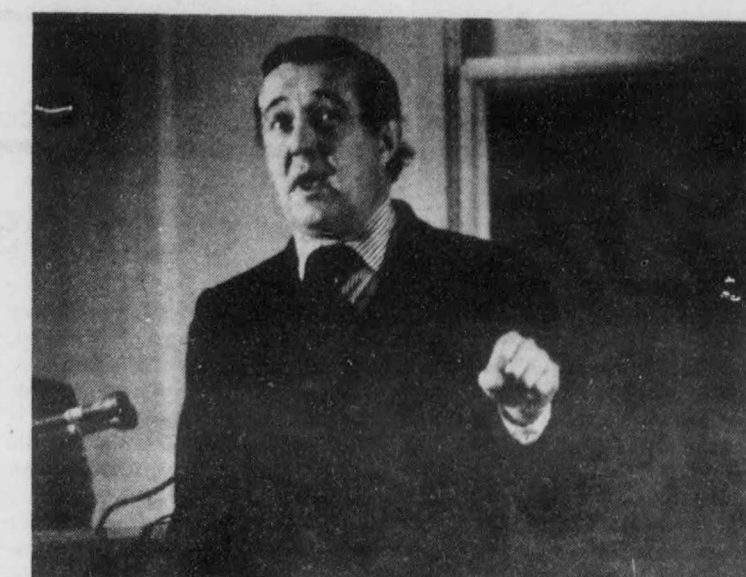
"Listen, one more wisecrack out of you and . . ."