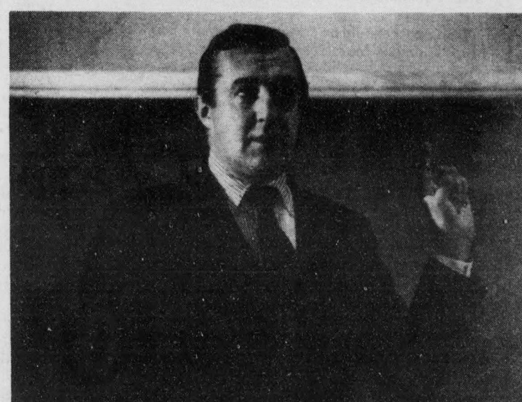
"They build these cubicles so low."