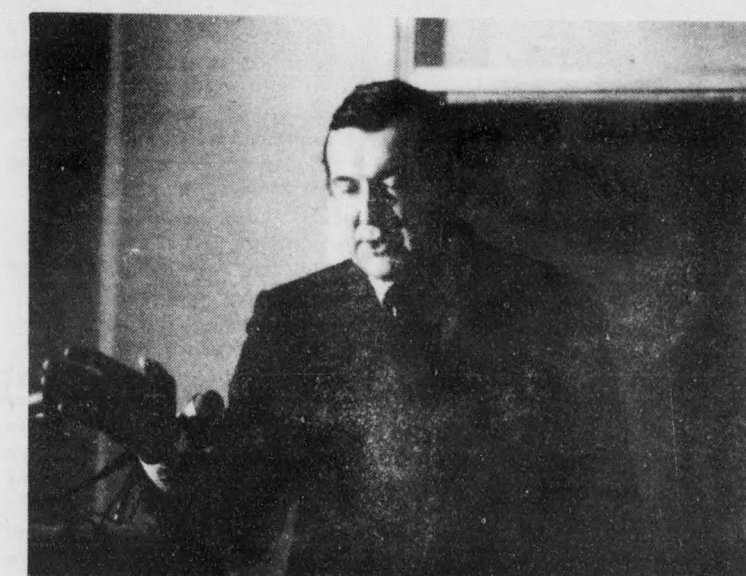
"I'm a little teapot, short and stout . . ."