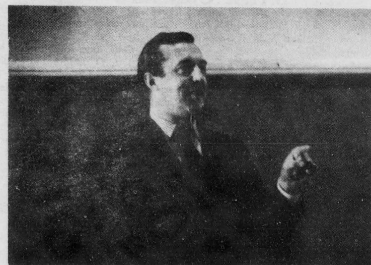
"See the doggie on the wall."