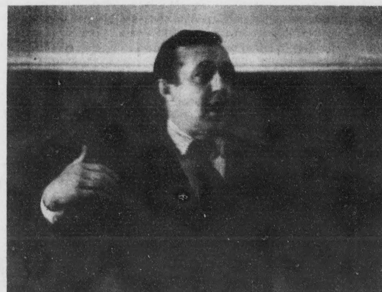
"Which one of you threw the pie the last time I was here?"