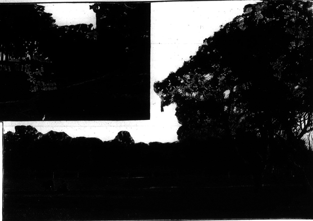
The South Side, Kildonan Park, Winnipeg.

farm be a large or a small one, the very best possible results.