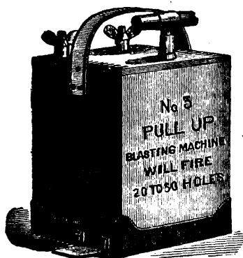
SEND FOR CATALOGUE.