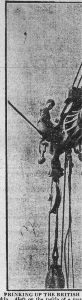
PRINKING UP THE BRITISH ship. Aloft on the tackle of a mar

GIVES sure results—a biscuit, cake and pie and wholesome. TRY BUY THE FOUND IDENTIFIED BY THIS COFFEE, BAKING POWDER, MI The F. F. DALLEY CORPORATION