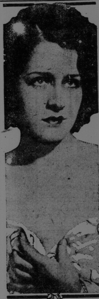
Norma Shearer, as the daughter of the 'Bentons,' in 'Pleasure Mad.'