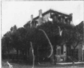
HAMILTON PRIVATE HOSPITAL.