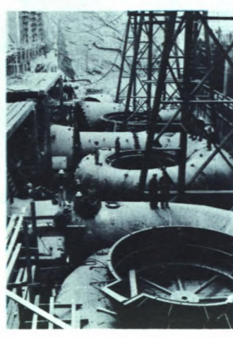
Power house under construction at the Warsak project in Pakistan.