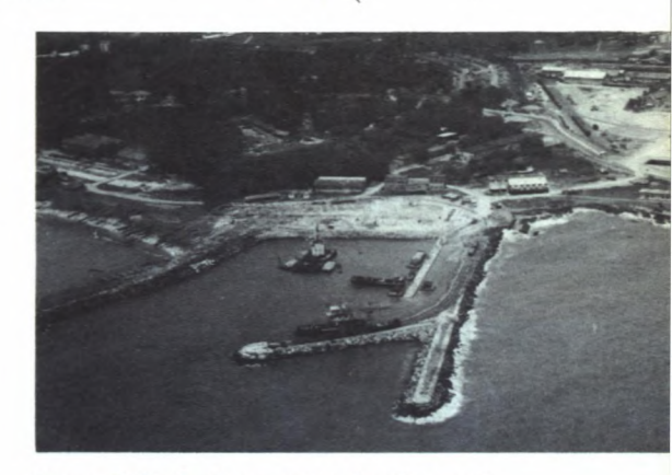
View of the harbour under development in Ceylon for the use of fishing vessels. In the centre is the site of the cold storage and by-products plant, built by Canada under the Colombo Plan. The breakwaters were constructed with counterpart funds from the sale of flour supplied by Canada.

Canada Dam, Mayurakshi Project, India. The project includes irrigation and hydroelectric works designed to raise the productivity of over 600,000 acres of arable farmlands as well as producing power for rural electrification.