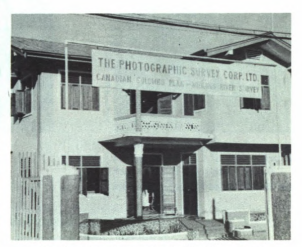
The headquarters office in Vientiane, Laos, for the Canadian survey of the Mekong River.