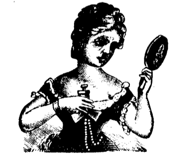
A skin of beauty is a joy forever.