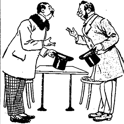
HE KNOWS 'EM.

Scott's Emulsion is a perfect Emulsion. It is a wonderful Flesh Producer. It is the Best Remedy for CONSUMPTION, Scrofula, Bronchitis, Wasting Diseases, Chronic Coughs and Colds. PALATABLE AS MILK. Scott's Emulsion is only put up in salmon color wrapper. Avoid all imitations or substitutions. Sold by all Druggists at 50c. and $1.00. SCOTT & BOWNE, Belleville.