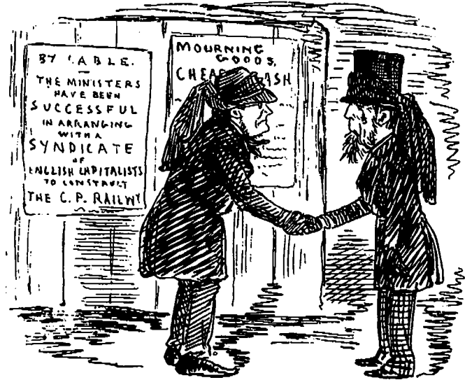
MOURNFUL NEWS OF THE MINISTERS' SUCCESS IN THEIR MISSION!

Aug.—"Mine eyes have play'd the painter, and both still'd thy beauty's form in tablet of my heart."