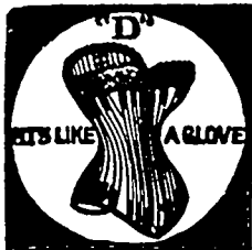
TWELVE FIRST MEDALS.

"FITS LIKE A GLOVE" THOMSON'S ENGLISH MADE, Glove-Fitting, Long Waisted. TRADE MARK.