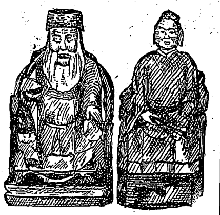
China (Taoism)—Tu Ti Kung and his Wifo (Penates).

Japan succeeds with a few objects of Shinto worship and an array of gilded