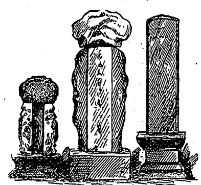
China (Ancestor Worship)—Ancestral Tablets

Egypt, which is illustrated in the collection