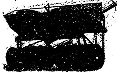
The above shows the Harrow with Removable Seeder.