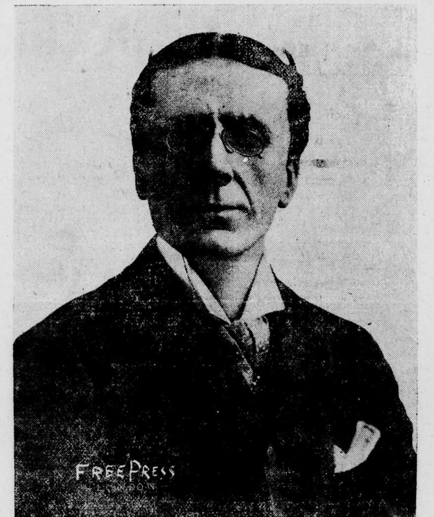
GEORGE GROSSMITH. Who will appear at New Grand Opera House Tuesday, March 4th.

GEORGE GROSSMITH. Mr. George Grossmith's entertainment at the New Grand on Tuesday next, it is said, will be one of the notable events of the present amusement season, as it is already attracting unusual notice in the musical and social circles. Mr. Grossmith's fame as an entertainer has been recognized again