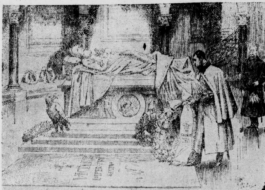
HIS ROYAL HIGHNESS PLACING WREATHS ON THE TOMBS OF THE EMPEROR AND EMPRESS FREDERICK IN THE MAUSOLEUM AT POTSDAM.

During his short stay in Berlin the Prince of Wales went to Potsdam and visited the Mausoleum of Friedrichsruhe, where the Empress Frederick was laid to rest in August last. On the tomb of the Emperor and Empress the Prince placed some wreaths of beautiful flowers.