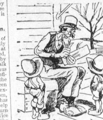
"NATURE GREW THAT PINE FOR THE MAN WITH THE JACKKNIFE."

My son, do you know why the state of Michigan was admitted into the Union and why every old hunker with a jackknife continues to swear by it?