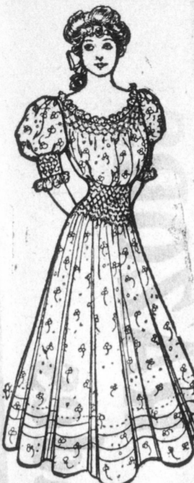
A SWISS 'FROM' FROCK.

All white makes the most attractive gown for a young girl, and, besides,