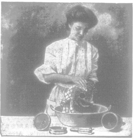
Washed in 15 to 30 minutes

One Minute's Washing as compared to at least fifteen. Wouldn't you like to save at least fourteen minutes twice a day? One minute with a cloth and brush cleans the absolutely simple Sharples Dairy Tubular Cream Separator bowl shown in the upper picture. It takes fifteen minutes to half an hour with a cloth and something to dig out dents, grooves, corners and holes to clean other bowl—one of which is shown in lower picture.