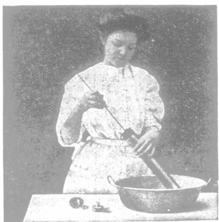
Washed in 1 minute

Also build FULL LINE heavy PUMPING MACHINERY. Catalog mailed on request.