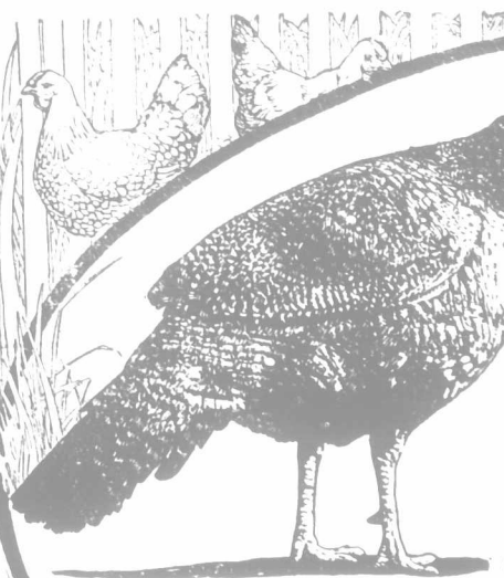
A penny's worth feeds 30 fowls one day. Sold on a written guarantee.